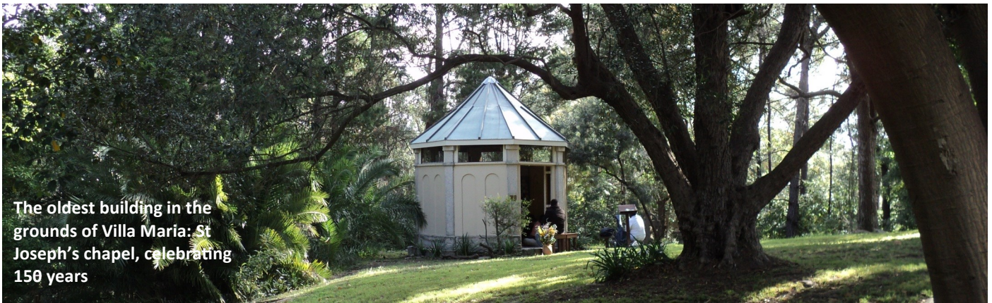
The oldest building in the grounds of Villa Maria: St Joseph's chapel, celebrating 150 years